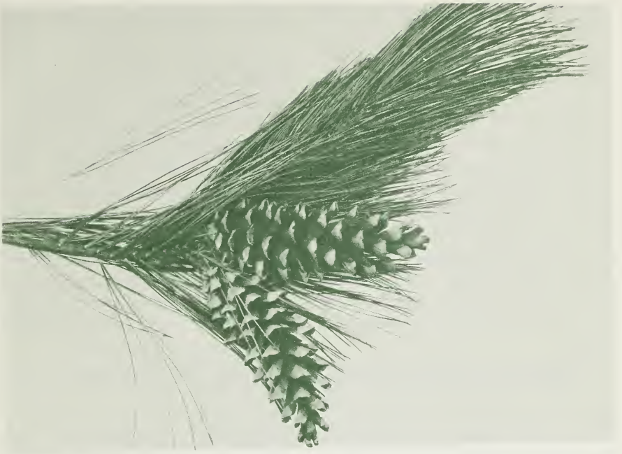
White pine. (About one-half natural size)